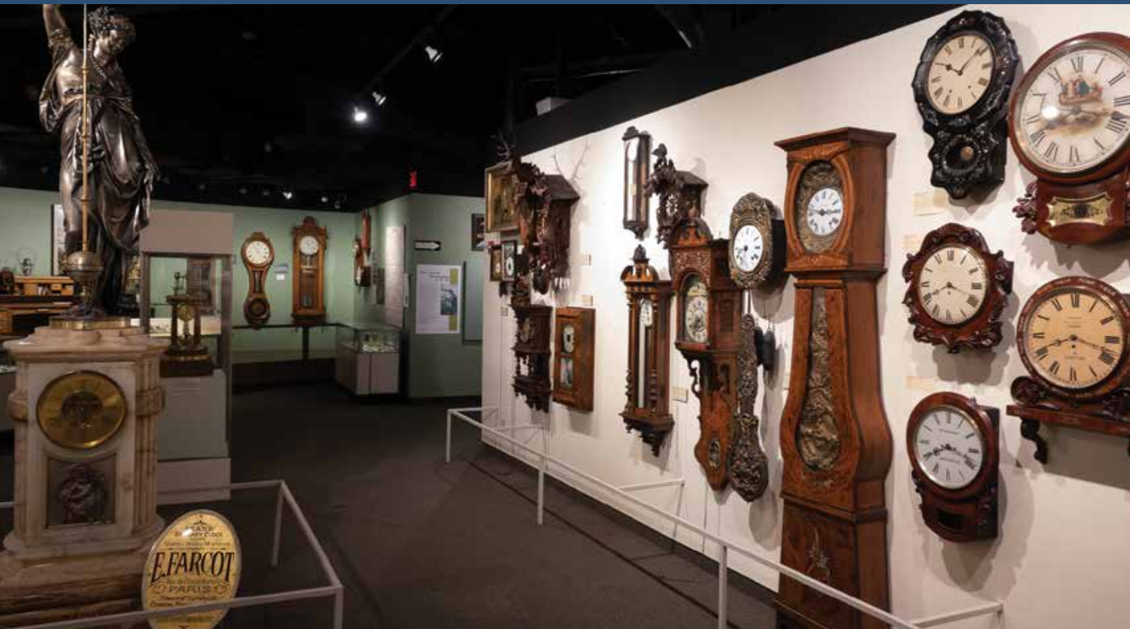
National Watch and Clock Museum with Lunch ... page 9